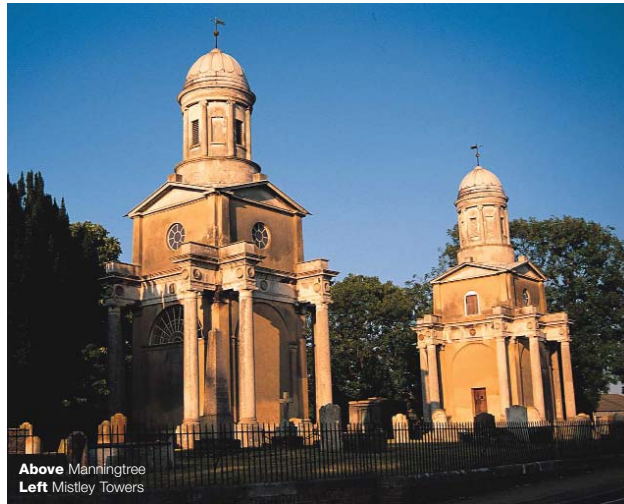
Above Manningtree Left Mistley Towers

July's walk, courtesy of the county's Public Rights of Way team, takes us from Mistley to Lawford via Manningtree experiencing splendid views on route