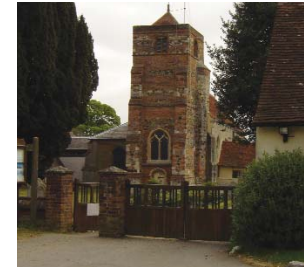
Above St Marys church, Lawford Right Mistley Quay Far right Mistley Place park